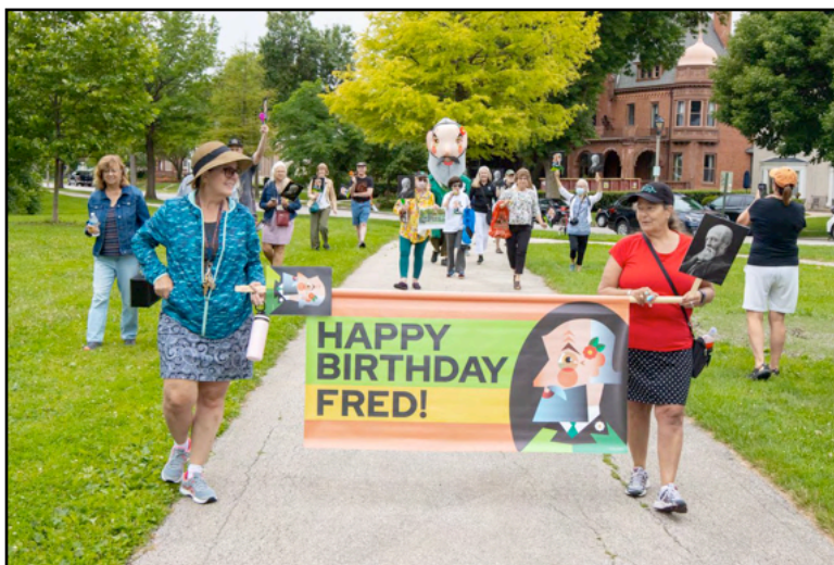
July 16 birthday celebration activities began with a parade through the park.

The festivities on July 16 included a parade, a concert, art tables, a scavenger hunt, a photo exhibit, a poster exhibit on Olmsted's life and work, and birthday cake (for 300+ people!). The poster exhibit, entitled "Frederick Law Olmsted: