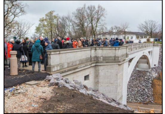
Over 100 people attended the bridge's opening ceremony.