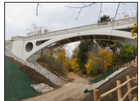
Ravine Road Concrete Footbridge, November 2022.