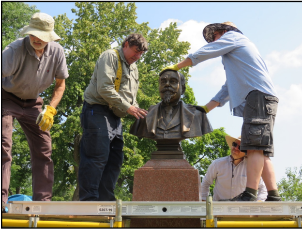
Staff from Vanguard Sculpture Services restored the bronze bust in their foundry and installed it back on its granite plinth in Lake Park.

Looking Back, Looking Forward, continued from page 1