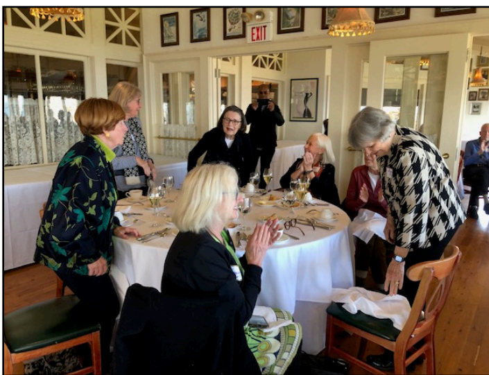
Lake Park Friends Founders are seated together to enjoy a Lake Park Bistro lunch and to share stories.