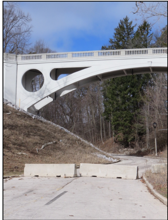
Ravine Road and Concrete Footbridge, March 2024.

To date the issue has not been considered by the Milwaukee Historic Preservation Commission. In the coming year we will be pushing to get the issue before the commission. Our mission statement highlights the importance of Olmsted's vision, and we are committed to ensuring that everything that happens in the park is consistent with that vision. We will also be pushing hard for a compromise on the road. The compromise we are offering addresses environmental issues and traffic concerns during times in summer when the lakefront is most crowded, as well as allowing for use by pedestrians, cyclists and cars.