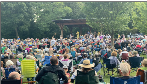
LPF celebrated its 25th year of Monday concerts in 2023 with record attendance.

analyzed input from former board members and longtime supporters and are in the process of establishing goals for the next three years. We are optimistic that this work will help us agree on the future direction of LPF and establish priorities as we move forward.